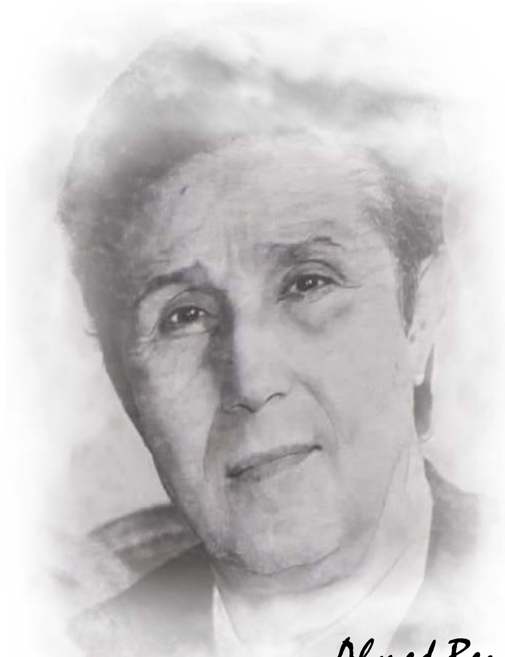
Ahmed Ben Bella

Disturbed by the animus against Muslims expressed by his European teacher, he began chafing against imperialism and colonialism and criticized the domination of French cultural influence over Algeria. During this period, he joined the nationalist revolution movement. He served as the head of government of Algeria from September 27th,1962 to September 15th, 1963 and then the first president of Algeria from September 15th, 1963 to June 19th 1965.