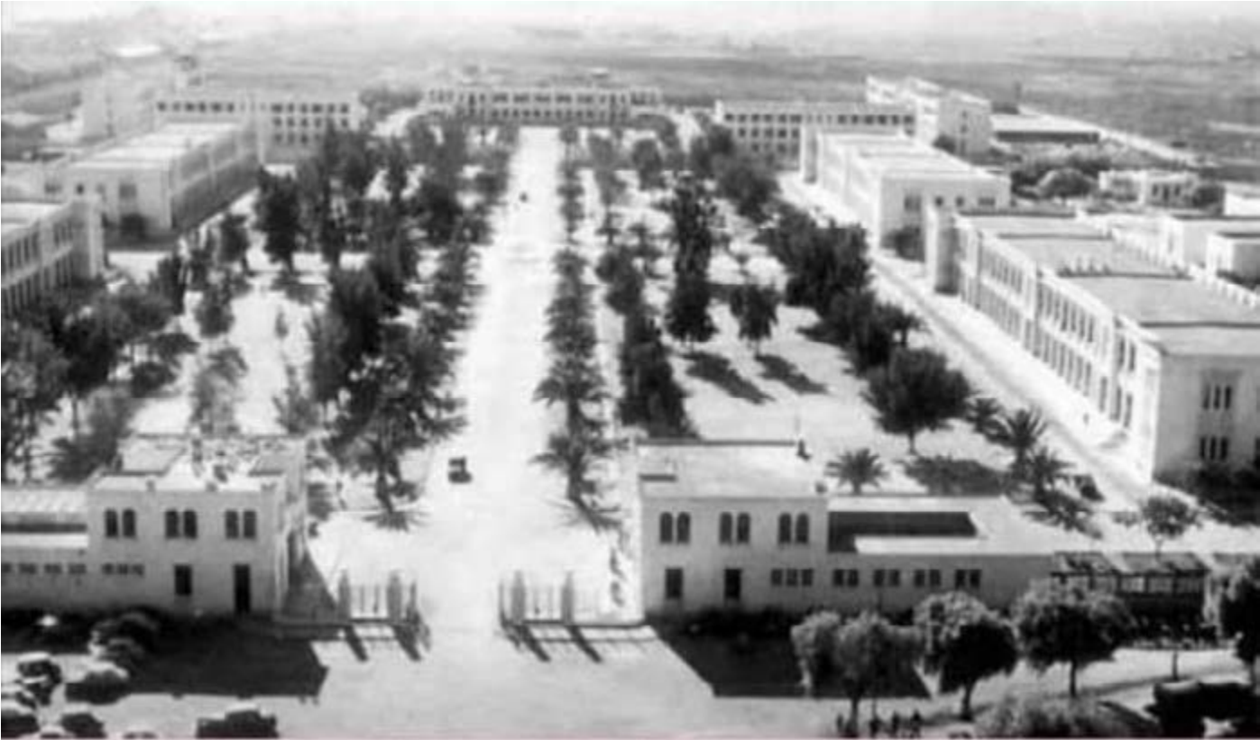
Es-Senia Campus during the sixties